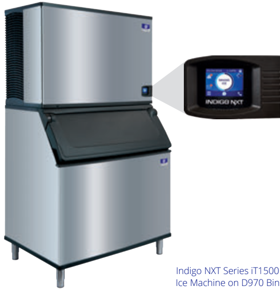
Indigo NXT Series iT1500 Ice Machine on D970 Bin

Designed for operators who know that ice is critical to their business, the Indigo NXT Series ice machine's preventative diagnostics continually monitor itself for reliable ice production. Improvements in cleanability and programmability make your ice machine easy to own and less expensive to operate.